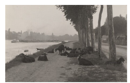
Alfred Stieglitz Goats outside Paris 1894, printed 1929/1934 gelatin silver print Key Set Number 124 same negative