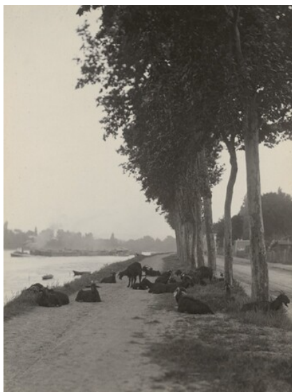
Alfred Stieglitz Goats outside Paris 1894, printed 1929/1934 gelatin silver print Kens et Number 122 Key Set Number 123 same negative