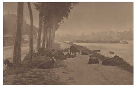
Alfred Stieglitz A Decorative Panel 1894 carbon print Key Set Number 118 same negative