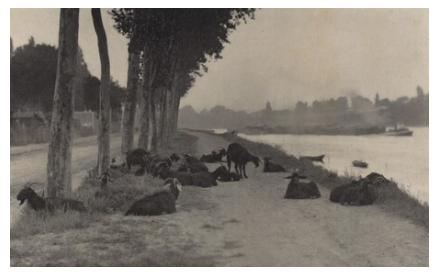
Alfred Stieglitz A Decorative Panel 1894, printed 1903/1904 photogravure Key Set Number 122 same negative