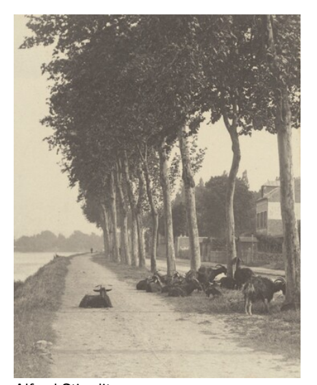
Alfred Stieglitz Homeward 1894, printed 1929/1934 gelatin silver print Key Set Number 126