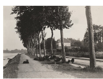
Alfred Stieglitz Homeward 1894, printed 1929/1934 gelatin silver print Key Set Number 126