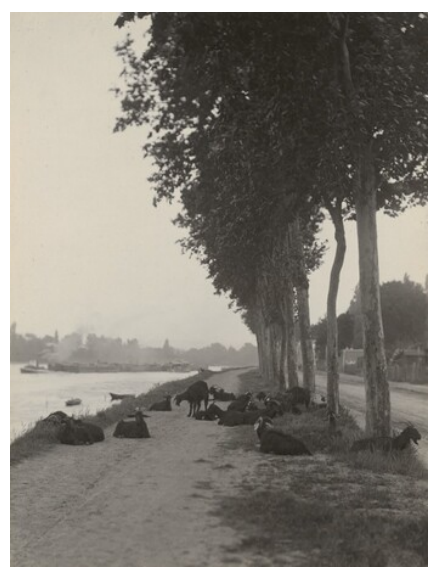
Alfred Stieglitz Goats outside Paris 1894, printed 1929/1934 gelatin silver print Key Set Number 123 same negative