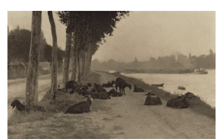
Alfred Stieglitz On the Seine—Near Paris 1894, printed 1897 photogravure Key Set Number 121 same negative