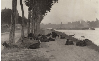
Alfred Stieglitz On the Seine—Near Paris 1894, printed 1897 photogravure Key Set Number 120 same negative