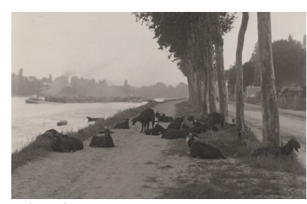
Alfred Stieglitz Goats outside Paris 1894, printed 1929/1934 gelatin silver print Key Set Number 124 same negative