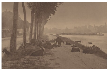
Alfred Stieglitz A Decorative Panel 1894 carbon print Key Set Number 118 same negative