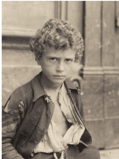
Alfred Stieglitz A Venetian Gamin 1894, printed 1895/1896 platinum print Key Set Number 168 same negative