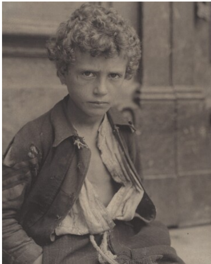
Alfred Stieglitz A Venetian Gamin 1894 platinum print Key Set Number 167 same negative