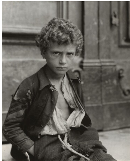
Alfred Stieglitz A Venetian Gamin 1894, printed 1929/1934 gelatin silver print Key Set Number 169 same negative