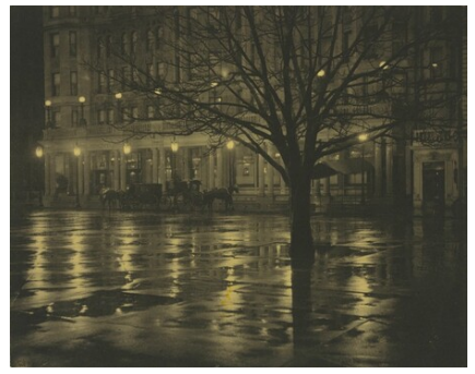
Alfred Stieglitz Savoy Hotel, New York 1897 platinum print Key Set Number 253 same negative