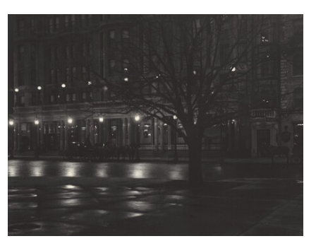
Alfred Stieglitz Night—The Savoy 1897, printed 1929/1932 gelatin silver print Key Set Number 255