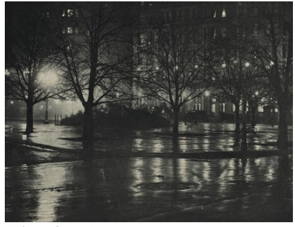
Alfred Stieglitz Reflections: Night-New York 1897 photogravure Key Set Number 252