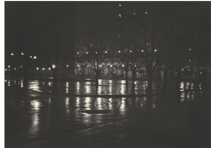
Alfred Stieglitz Night, New York 1897, printed 1929/1934 gelatin silver print Key Set Number 256