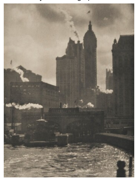
Alfred Stieglitz (editor/publisher) after Various Artists Alfred Stieglitz City of Ambition 1910, printed 1911 photogravure Key Set Number 341 same negative