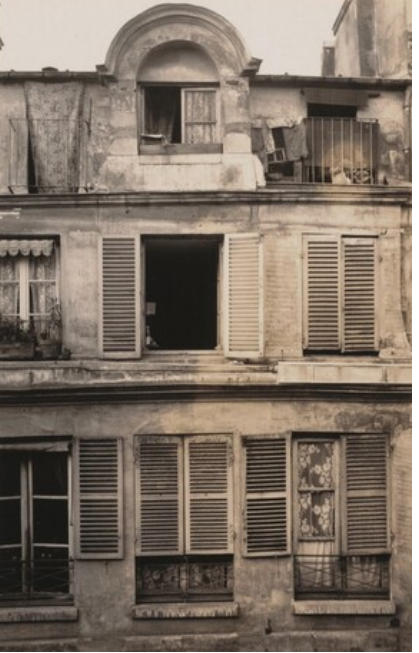
Alfred Stieglitz Paris 1894, printed 1929/1934 gelatin silver print Key Set Number 363