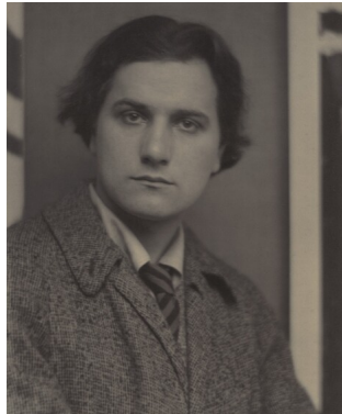
Alfred Stieglitz American, 1864 - 1946