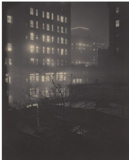
Alfred Stieglitz From the Back-Window—291 1915 platinum print Key Set Number 423