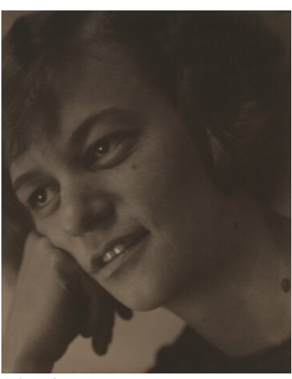
Alfred Stieglitz Dorothy True 1919 palladium print Key Set Number 607