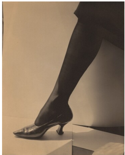
Alfred Stieglitz Dorothy True 1919 palladium print Key Set Number 606