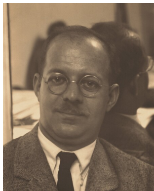
Alfred Stieglitz American, 1864 - 1946