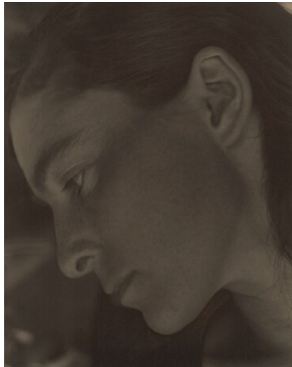
Alfred Stieglitz Rebecca Salsbury Strand 1922 palladium print Key Set Number 743