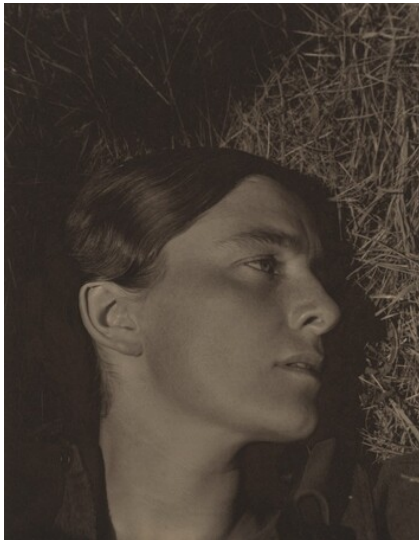
Alfred Stieglitz Rebecca Salsbury Strand 1922 palladium print Key Set Number 746 same negative