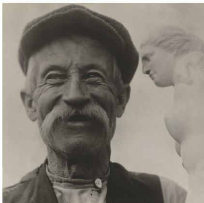
Alfred Stieglitz Bly and Venus 1920 gelatin silver print Key Set Number 624