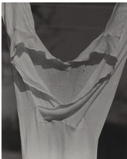
Alfred Stieglitz Long Underwear, Lake George 1924 gelatin silver print Key Set Number 1038

by Georgia O'Keeffe, on mount, upper left verso, in graphite: 207 D