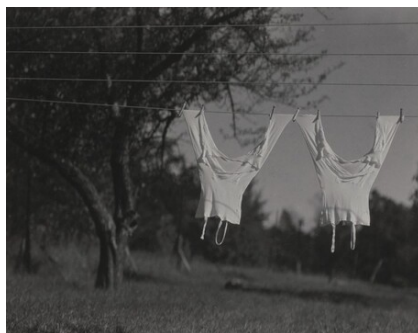
Alfred Stieglitz Long Underwear, Lake George 1924 gelatin silver print Key Set Number 1035