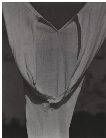
Alfred Stieglitz Long Underwear, Lake George 1924 gelatin silver print Key Set Number 1037