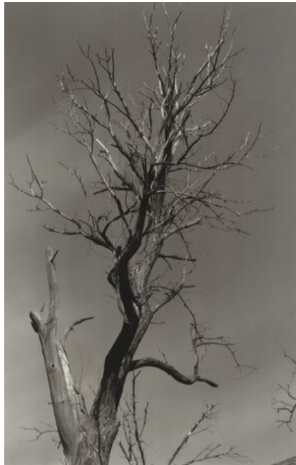
Alfred Stieglitz The Dying Chestnut Tree or Life and Death 1927 gelatin silver print Key Set Number 1193