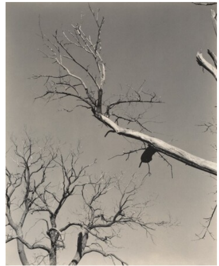
Alfred Stieglitz The Dying Chestnut Tree—My Teacher 1927 gelatin silver print Key Set Number 1194