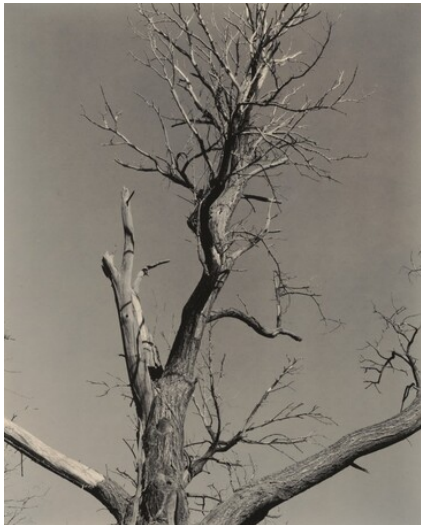
Alfred Stieglitz The Dying Chestnut Tree 1927 gelatin silver print Key Set Number 1191