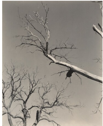
Alfred Stieglitz The Dying Chestnut Tree—My Teacher 1927 gelatin silver print Key Set Number 1194