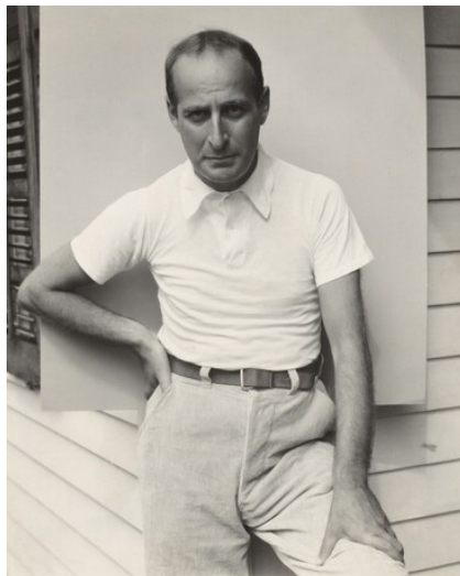
Alfred Stieglitz Louis Kalonyme 1932 gelatin silver print Key Set Number 1477