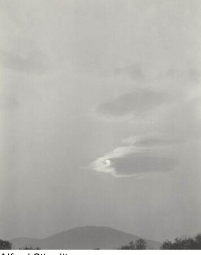
Alfred Stieglitz Music—A Sequence of Ten Cloud Photographs, No. VIII 1922 gelatin silver print Key Set Number 800