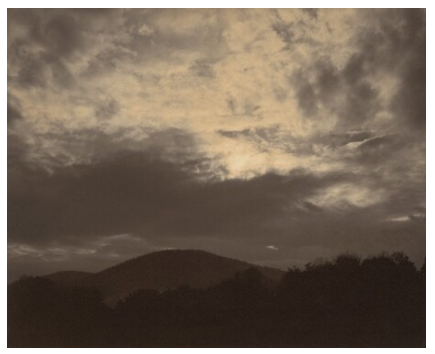
Alfred Stieglitz Music—A Sequence of Ten Cloud Photographs, No. III 1922 palladium print Key Set Number 795