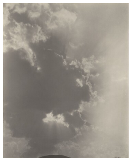
Alfred Stieglitz Music—A Sequence of Ten Cloud Photographs, No. VII 1922 gelatin silver print Key Set Number 799