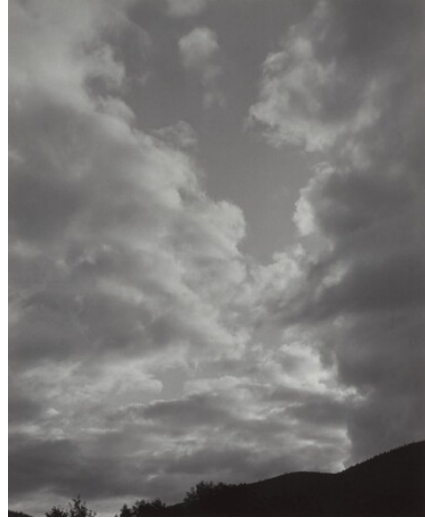
Alfred Stieglitz Music—A Sequence of Ten Cloud Photographs, No. II 1922 gelatin silver print Key Set Number 794

Alfred Stieglitz Music—A Sequence of Ten Cloud Photographs, No. II 1922 gelatin silver print Key Set Number 793