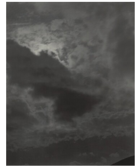
Alfred Stieglitz Music—A Sequence of Ten Cloud Photographs, No. VI 1922 gelatin silver print Key Set Number 798

Alfred Stieglitz Music—A Sequence of Ten Cloud Photographs, No. V 1922 gelatin silver print Key Set Number 797