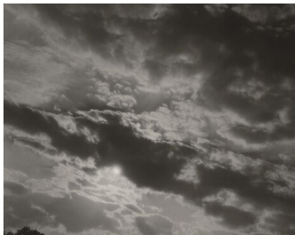
Alfred Stieglitz Songs of the Sky A2 1923 gelatin silver print Key Set Number 890