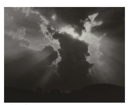
Alfred Stieglitz Songs of the Sky A9 gelatin silver print Key Set Number 897