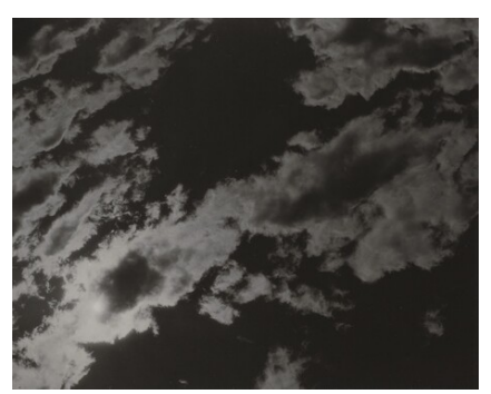
Alfred Stieglitz Songs of the Sky A5 1923 gelatin silver print Key Set Number 893