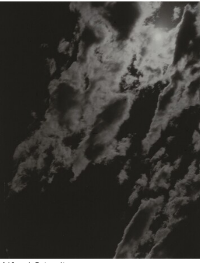
Alfred Stieglitz Songs of the Sky A6 gelatin silver print Key Set Number 894