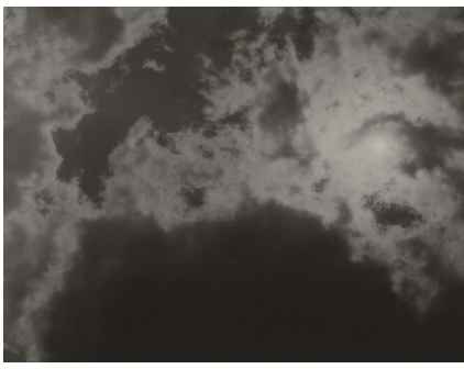
Alfred Stieglitz Songs of the Sky A4 1923 gelatin silver print Key Set Number 892