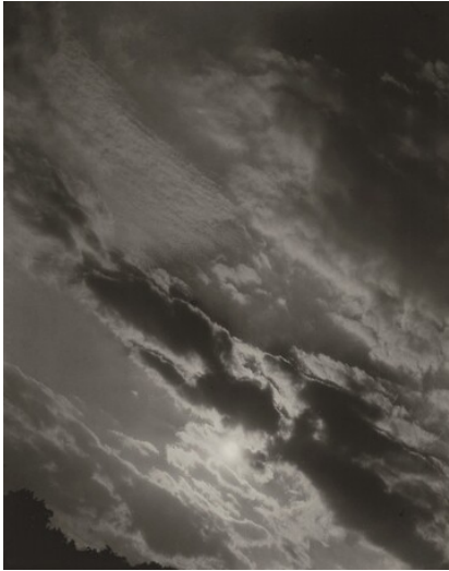
Alfred Stieglitz Songs of the Sky A3 1923 gelatin silver print Key Set Number 891