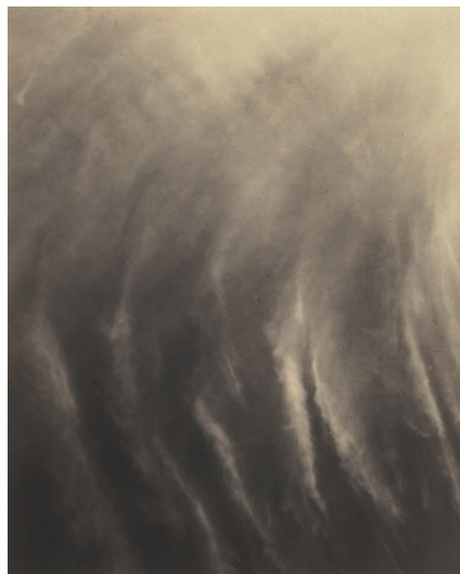
Alfred Stieglitz Equivalent 1925 gelatin silver print Key Set Number 1102