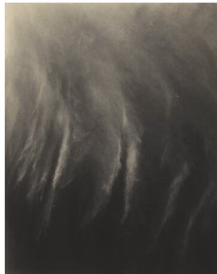
Alfred Stieglitz Equivalent 1925 gelatin silver print Key Set Number 1105