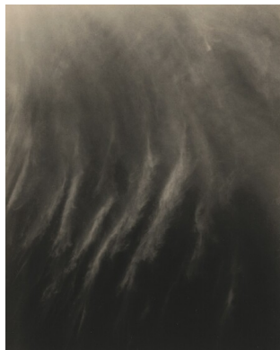
Alfred Stieglitz American, 1864 - 1946