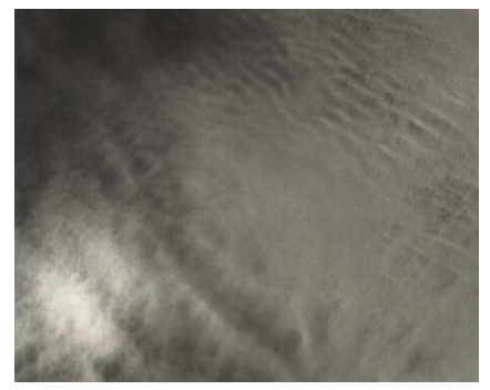
Alfred Stieglitz Equivalent possibly 1926 gelatin silver print Key Set Number 1169