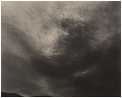
Alfred Stieglitz Equivalent 1926 gelatin silver print Key Set Number 1168