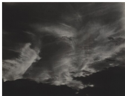
Alfred Stieglitz Equivalents 1927 gelatin silver print Key Set Number 1230