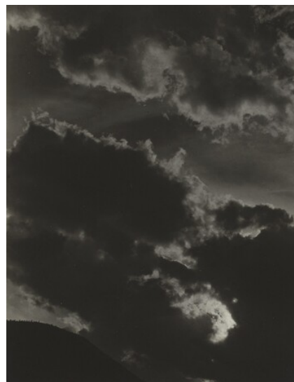
Alfred Stieglitz Equivalent 1927 gelatin silver print Key Set Number 1233

The dates for this photograph and Key Set number 1233 are based on compositional similarities to Key Set numbers 1230 and 1231. Also, the photographic materials are consistent with those of other prints dated 1927.