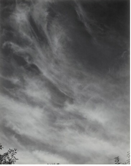
Alfred Stieglitz Equivalent 27B 1933 gelatin silver print Key Set Number 1513 same negative

Alfred Stieglitz Equivalent 27A 1933 gelatin silver print Key Set Number 1512 same negative