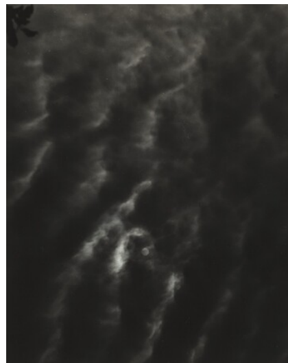
Alfred Stieglitz Equivalent, Set C2 No. 3 1929 gelatin silver print Key Set Number 1255