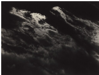
Alfred Stieglitz Equivalent 1929 gelatin silver print Key Set Number 1271