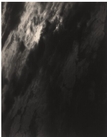
Alfred Stieglitz Equivalent O2 1929 gelatin silver print Key Set Number 1264