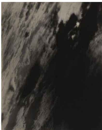
Alfred Stieglitz Equivalent O6 1929 gelatin silver print Key Set Number 1268