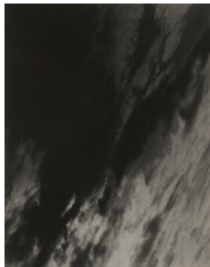
Alfred Stieglitz Equivalent O4 1929 gelatin silver print Key Set Number 1266