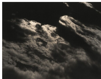
Alfred Stieglitz Equivalent O8 1929 gelatin silver print Key Set Number 1270