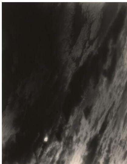
Alfred Stieglitz Equivalent O3 1929 gelatin silver print Key Set Number 1265