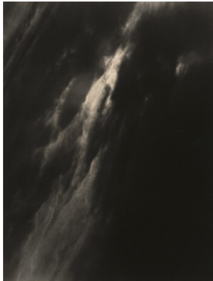
Alfred Stieglitz Equivalent W3 1929 gelatin silver print Key Set Number 1279