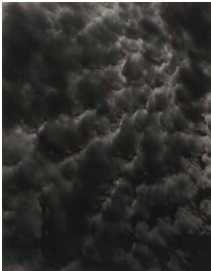
Alfred Stieglitz Equivalent W2 1929 gelatin silver print Key Set Number 1278