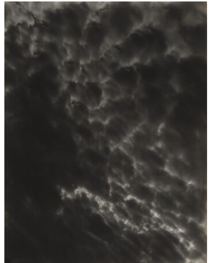
Alfred Stieglitz Equivalent W4 1929 gelatin silver print Key Set Number 1280