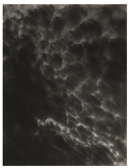
Alfred Stieglitz Equivalent W4 1929 gelatin silver print Key Set Number 1280