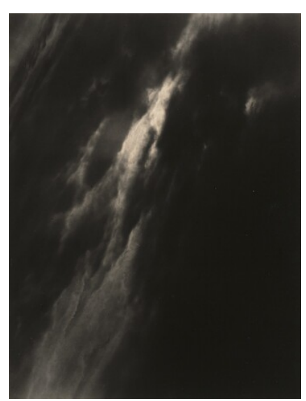
Alfred Stieglitz Equivalent W3 1929 gelatin silver print Key Set Number 1279