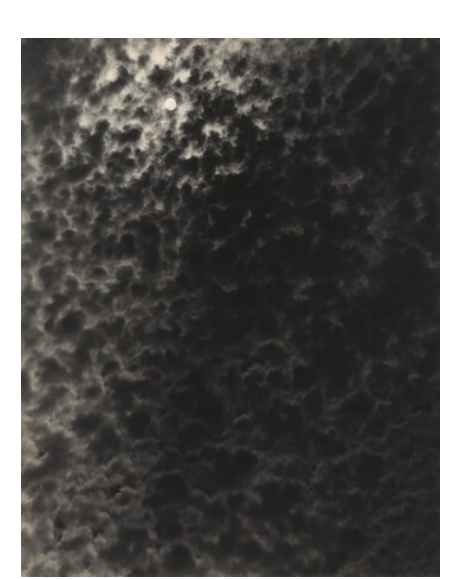
Alfred Stieglitz Equivalent W5 1929 gelatin silver print Key Set Number 1281