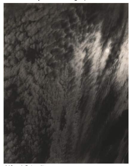
Alfred Stieglitz Equivalent, Series XX No. 2 1929 gelatin silver print Key Set Number 1285