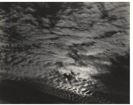
Alfred Stieglitz Equivalent, Series XX No. 6 1929 gelatin silver print Key Set Number 1289