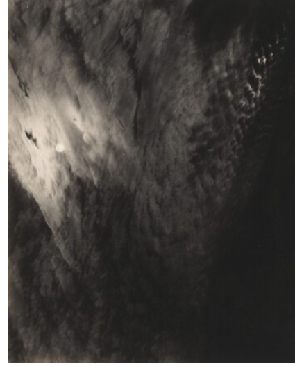
Alfred Stieglitz Equivalent, Series XX No. 9 1929 gelatin silver print Key Set Number 1292