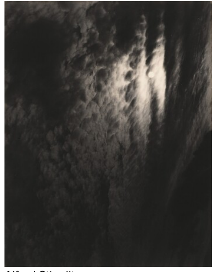
Alfred Stieglitz Equivalent, Series XX No. 3 1929 gelatin silver print Key Set Number 1286