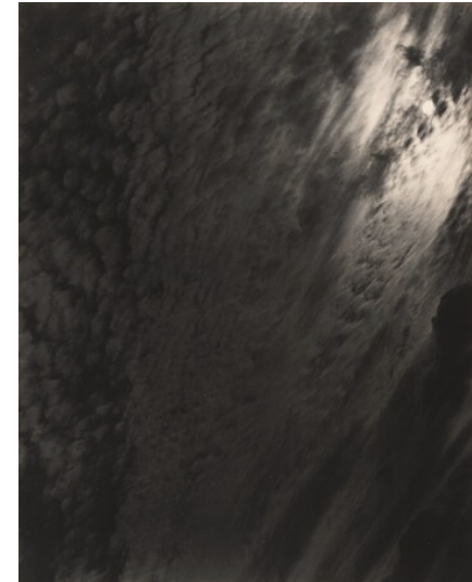
Alfred Stieglitz Equivalent, Series XX No. 7 1929 gelatin silver print Key Set Number 1290