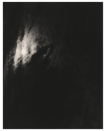
Alfred Stieglitz Equivalent, Series XX No. 8 1929 gelatin silver print Key Set Number 1291