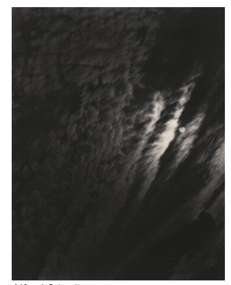
Alfred Stieglitz Equivalent, Series XX No. 4 1929 gelatin silver print Key Set Number 1287