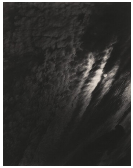
Alfred Stieglitz Equivalent, Series XX No. 4 1929 gelatin silver print Key Set Number 1287