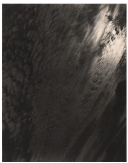
Alfred Stieglitz Equivalent, Series XX No. 7 1929 gelatin silver print Key Set Number 1290