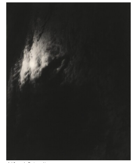
Alfred Stieglitz Equivalent, Series XX No. 8 1929 gelatin silver print Key Set Number 1291