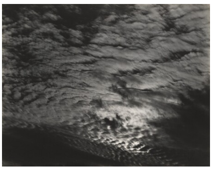
Alfred Stieglitz Equivalent, Series XX No. 6 1929 gelatin silver print Key Set Number 1289