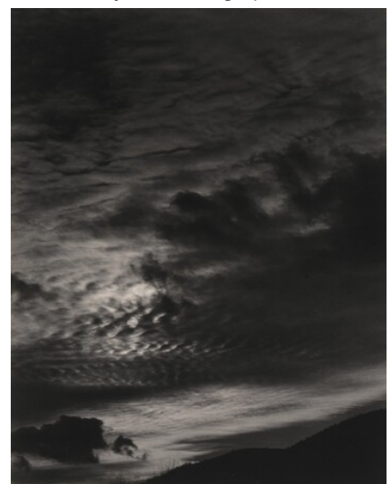
Alfred Stieglitz Equivalent, Series XX No. 1 1929 gelatin silver print Key Set Number 1284