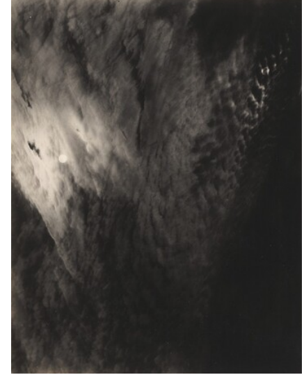
Alfred Stieglitz Equivalent, Series XX No. 9 1929 gelatin silver print Key Set Number 1292