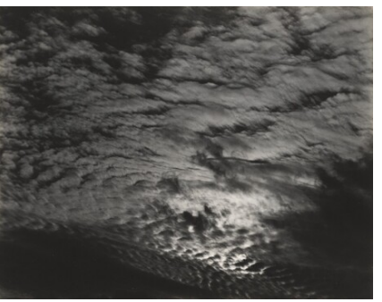
Alfred Stieglitz Equivalent, Series XX No. 6 1929 gelatin silver print Key Set Number 1289