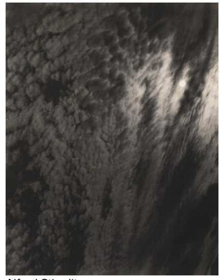
Alfred Stieglitz Equivalent, Series XX No. 2 1929 gelatin silver print Key Set Number 1285