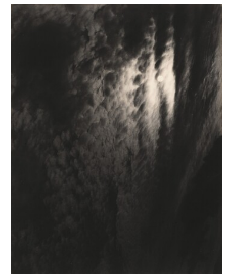
Alfred Stieglitz Equivalent, Series XX No. 3 1929 gelatin silver print Key Set Number 1286