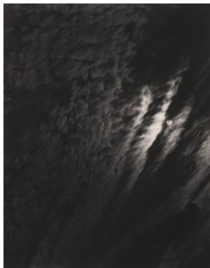
Alfred Stieglitz Equivalent, Series XX No. 4 1929 gelatin silver print Key Set Number 1287