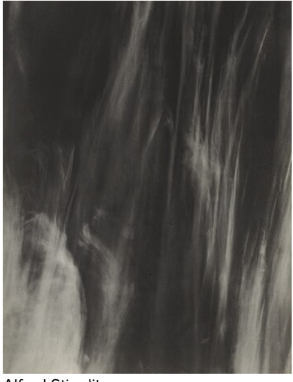
Alfred Stieglitz Equivalent 1934 gelatin silver print Key Set Number 1562