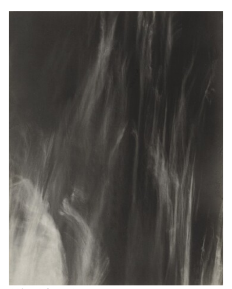
Alfred Stieglitz Equivalent 1934 gelatin silver print Key Set Number 1561