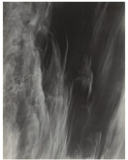
Alfred Stieglitz Equivalent 1934 gelatin silver print Key Set Number 1560