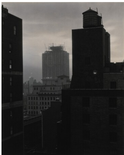
Alfred Stieglitz From My Window at An American Place, Southwest 1932 gelatin silver print Key Set Number 1456