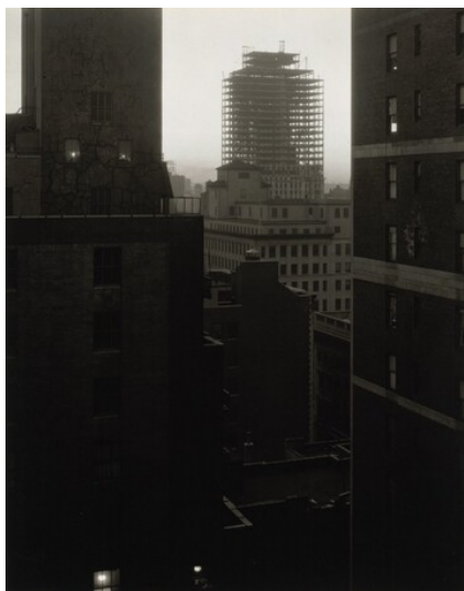
Alfred Stieglitz From My Window at An American Place, Southwest March 1932 gelatin silver print Key Set Number 1453