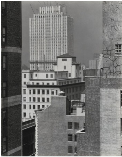
Alfred Stieglitz From My Window at An American Place, Southwest April/June 1932 gelatin silver print Key Set Number 1459