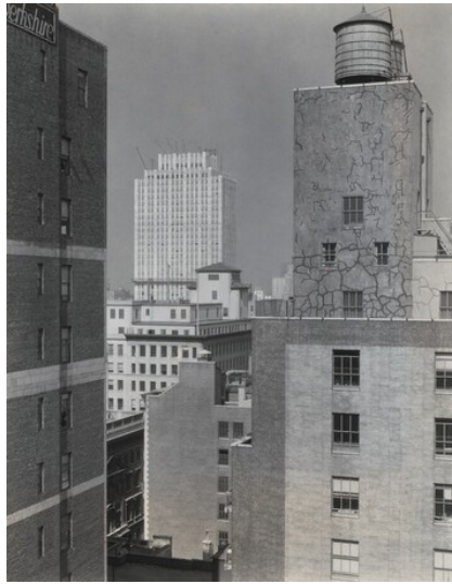
Alfred Stieglitz From My Window at An American Place, Southwest April/June 1932 gelatin silver print Key Set Number 1460