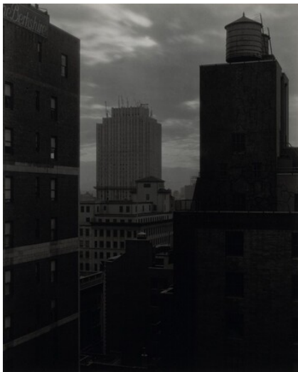
Alfred Stieglitz From My Window at An American Place, Southwest April/June 1932 gelatin silver print Key Set Number 1462

This photograph and Key Set numbers 1453–1462 depict the construction of the RKO Building at Rockefeller Center. The project is so thoroughly documented that