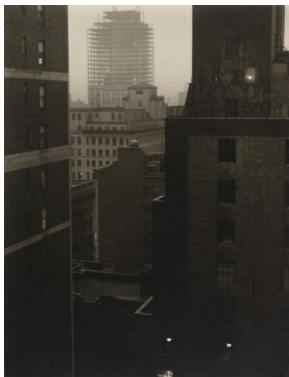
Alfred Stieglitz From My Window at An American Place, Southwest March 1932 gelatin silver print Key Set Number 1454