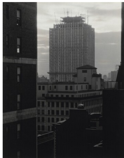
Alfred Stieglitz From My Window at An American Place, Southwest April 1932 gelatin silver print Key Set Number 1458