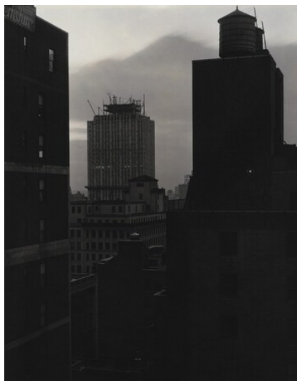
Alfred Stieglitz From My Window at An American Place, Southwest April 1932 gelatin silver print Key Set Number 1457