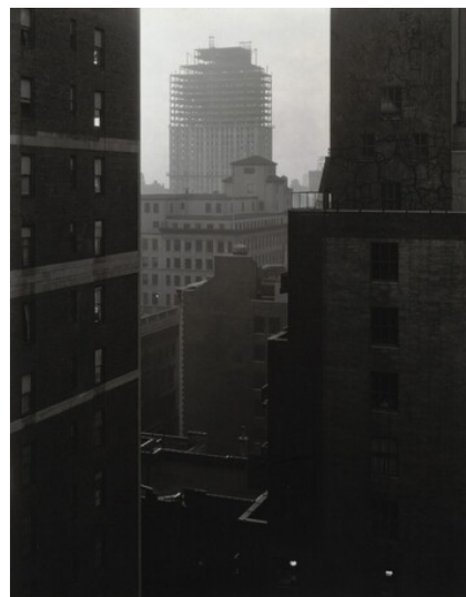
Alfred Stieglitz From My Window at An American Place, Southwest March 1932 gelatin silver print Key Set Number 1455