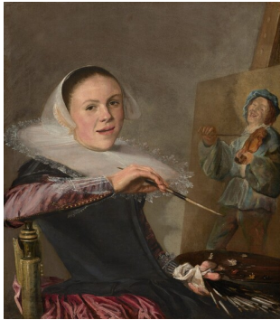
Judith Leyster Dutch, 1609 - 1660