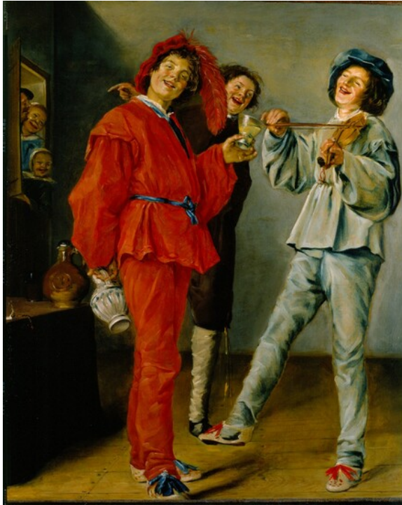
fig. 1 Judith Leyster, Merry Company , 1629/1631, oil on canvas, private collection, The Netherlands.