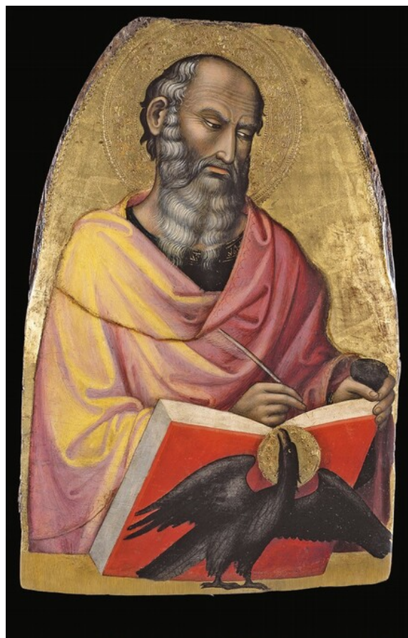
fig. 2 Martino di Bartolomeo, Saint John the Evangelist, 1425–1426, tempera on panel, private collection.