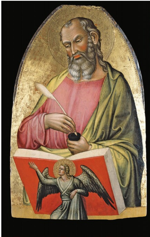
fig. 3 Martino di Bartolomeo, Saint Matthew, 1425–1426, tempera on panel, private collection.