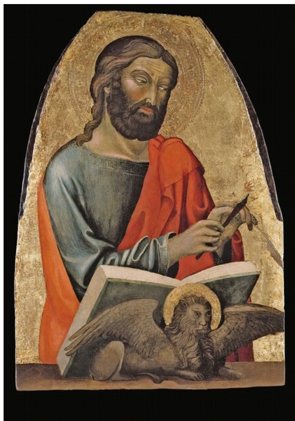
fig. 1 Martino di Bartolomeo, Saint Mark , 1425–1426, tempera on panel, private collection.