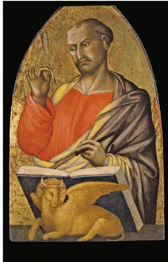
fig. 4 Martino di Bartolomeo, Saint Luke , 1425–1426, tempera on panel, private collection.