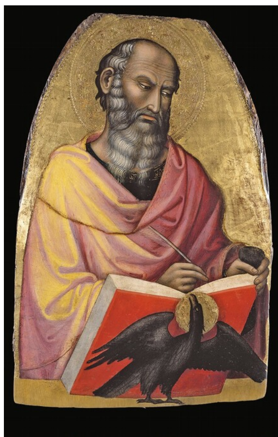
fig. 2 Martino di Bartolomeo, Saint John the Evangelist, 1425–1426, tempera on panel, private collection.