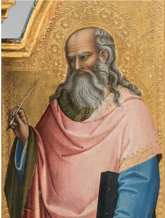
fig. 3 Detail of Saint John, Nardo di Cione, Madonna and Child, with Saints Peter and John the Evangelist, and Man of Sorrows , c. 1360, tempera on panel, National Gallery of Art, Washington, Samuel H. Kress Collection