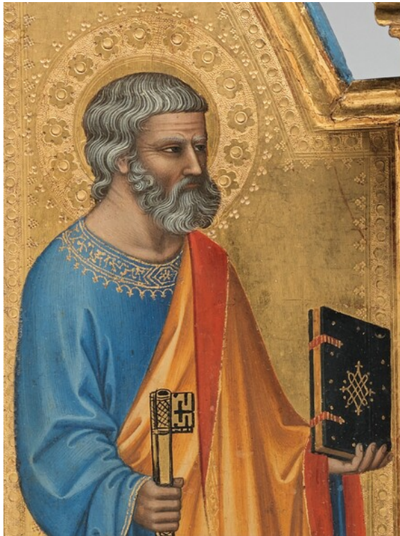
fig. 5 Detail of Saint Peter, Nardo di Cione, Madonna and Child, with Saints Peter and John the Evangelist, and Man of Sorrows , c. 1360, tempera on panel, National Gallery of Art, Washington, Samuel H. Kress Collection