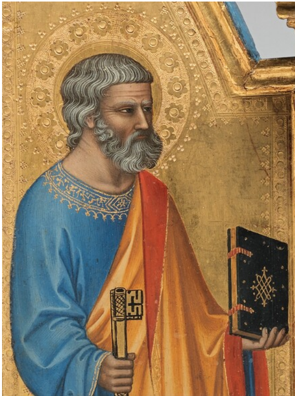
fig. 5 Detail of Saint Peter, Nardo di Cione, Madonna and Child, with Saints Peter and John the Evangelist, and Man of Sorrows , c. 1360, tempera on panel, National Gallery of Art, Washington, Samuel H. Kress Collection