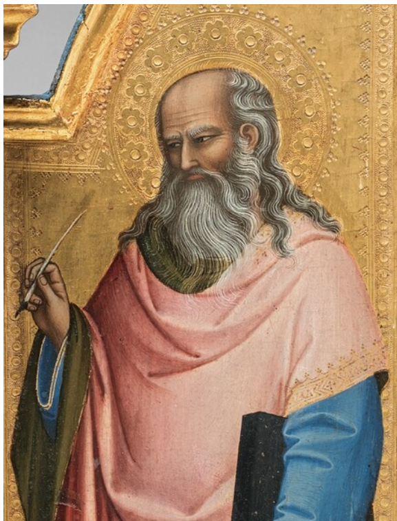
fig. 3 Detail of Saint John, Nardo di Cione, Madonna and Child, with Saints Peter and John the Evangelist, and Man of Sorrows , c. 1360, tempera on panel, National Gallery of Art, Washington, Samuel H. Kress Collection