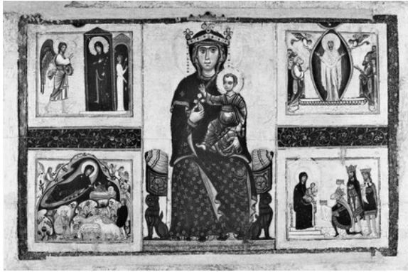
fig. 1 Margaritone and Ristoro d'Arezzo, Madonna and Child Enthroned and Four Stories of the Virgin , 1260s, tempera on panel, Santa Maria delle Vertighe, Monte San Savino (Arezzo).