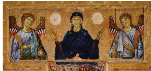
fig. 4 Detail of upper terminal, Master of the Franciscan Crucifixes, Painted Crucifix with the Madonna between Two Angels , c. 1270/1275, tempera on panel, Pinacoteca Nazionale di Bologna