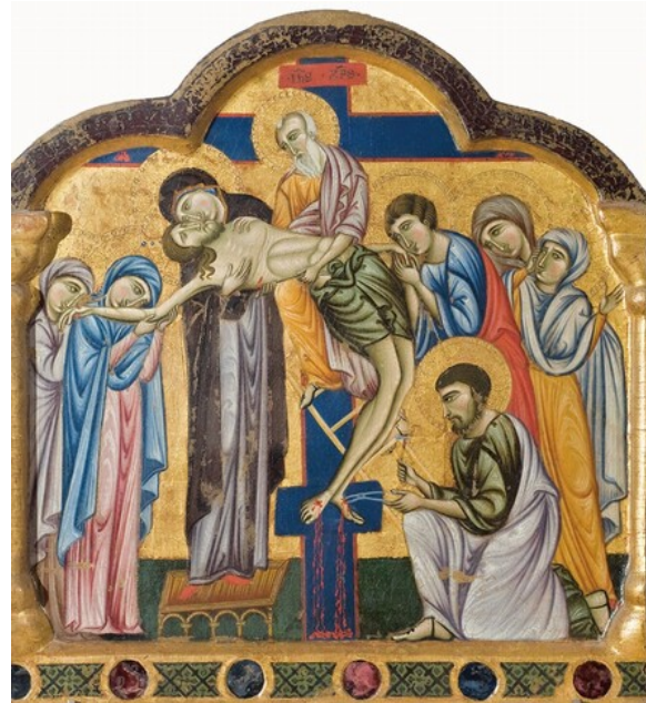
fig. 4 Master of Saint Francis, Deposition , c. 1272, tempera on panel, Galleria Nazionale dell'Umbria.