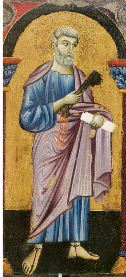
fig. 10 Master of Saint Francis, Saint Peter , c. 1272, tempera on panel, Galleria Nazionale dell'Umbria.