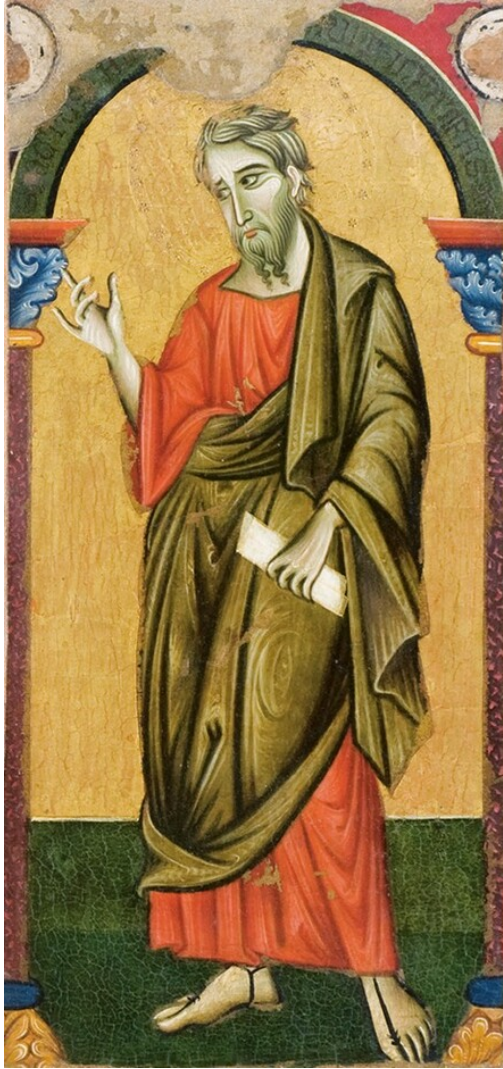
fig. 9 Master of Saint Francis, Saint Andrew , c. 1272, tempera on panel, Galleria Nazionale dell'Umbria.