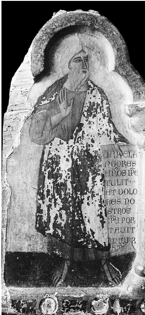
fig. 3 Master of Saint Francis, Prophet Isaiah , c. 1272, tempera on panel, Museo del Tesoro della Basilica di San Francesco, Assisi