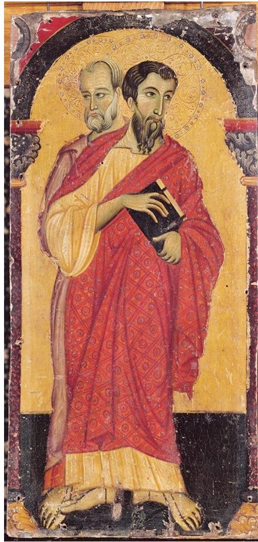
fig. 8 Master of Saint Francis, Saints Bartholomew and Simon , c. 1272, tempera on panel, The Metropolitan Museum of Art, New York, Robert Lehman Collection