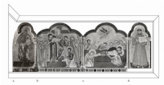
fig. 1 Reconstruction of an altarpiece formerly in San Francesco al Prato in Perugia, front side, right portion, by the Master of Saint Francis: a. Prophet Isaiah (fig. 3); b. Deposition (fig. 4); c. Lamentation (fig. 5); d. Saint Anthony of Padua (fig. 6)