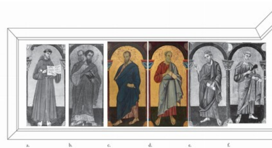
fig. 2 Reconstruction of an altarpiece formerly in San Francesco al Prato in Perugia, rear side, left portion, by the Master of Saint Francis (color images are NGA objects): a. Saint Francis (fig. 7); b. Saints Bartholomew and Simon (fig. 8); c. Saint James Minor ; d. Saint John the Evangelist ; e. Saint Andrew (fig. 9); f. Saint Peter (fig. 10)