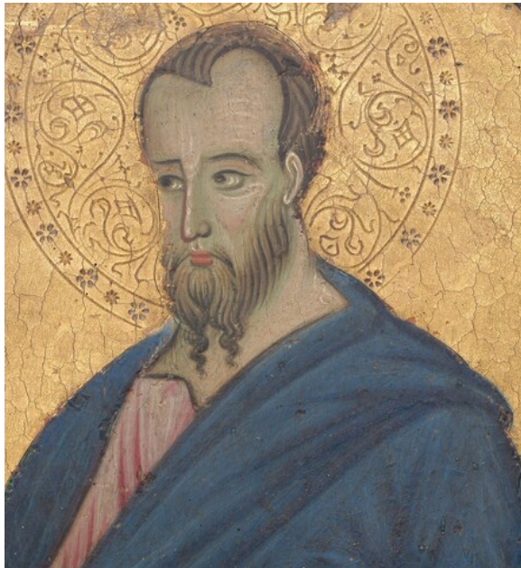
fig. 11 Detail, Master of Saint Francis, Saint James Minor , c. 1272, tempera on panel, National Gallery of Art, Washington, Samuel H. Kress Collection