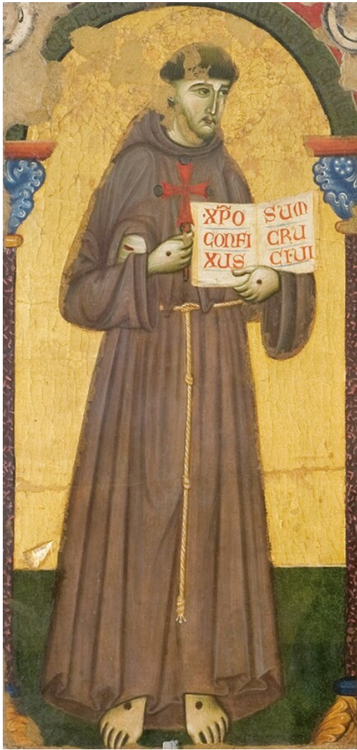
fig. 7 Master of Saint Francis, Saint Francis , c. 1272, tempera on panel, Galleria Nazionale dell'Umbria.