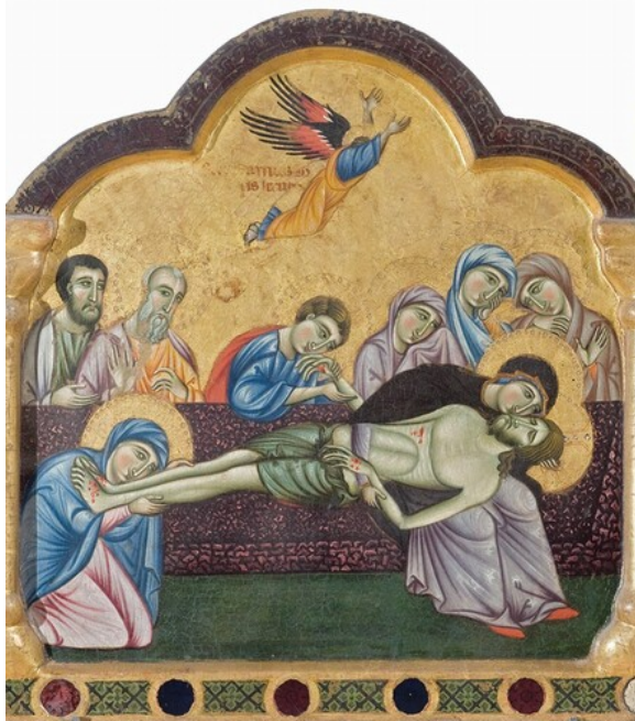
fig. 5 Master of Saint Francis, Lamentation , c. 1272, tempera on panel, Galleria Nazionale dell'Umbria.