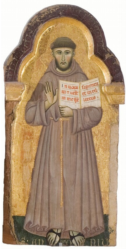
fig. 6 Master of Saint Francis, Saint Anthony of Padua , c. 1272, tempera on panel, Galleria Nazionale dell'Umbria.