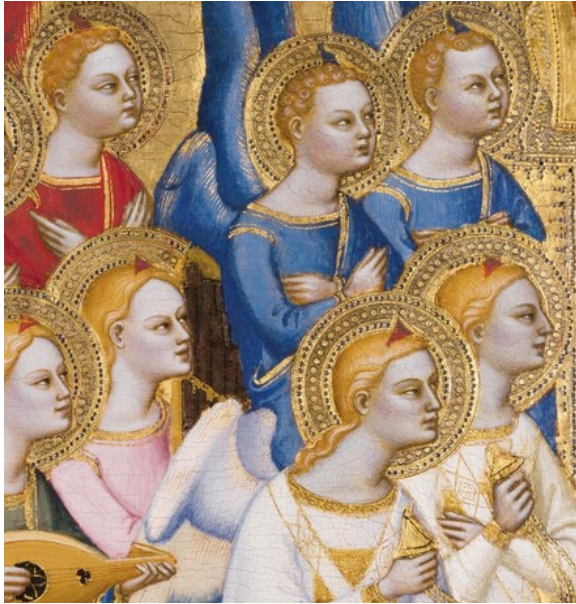
fig. 3 Detail of angels in adoration, Jacopo di Cione, San Pier Maggiore altarpiece, 1370–1371, tempera on panel, National Gallery, London.