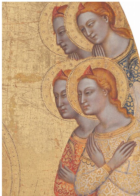
fig. 2 Detail of angels, Jacopo di Cione, Madonna and Child with God the Father Blessing and Angels , c. 1370/1375, tempera on panel, National Gallery of Art, Washington, Samuel H. Kress Collection