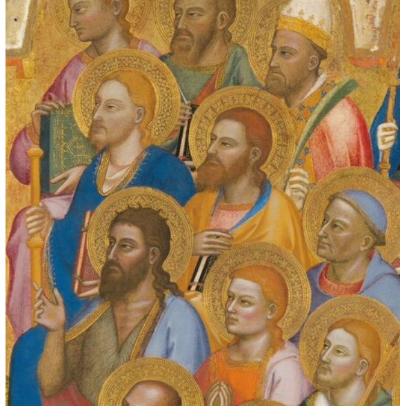
fig. 6 Detail of adoring saints, Jacopo di Cione, San Pier Maggiore altarpiece, 1370–1371, tempera on panel, National Gallery, London.