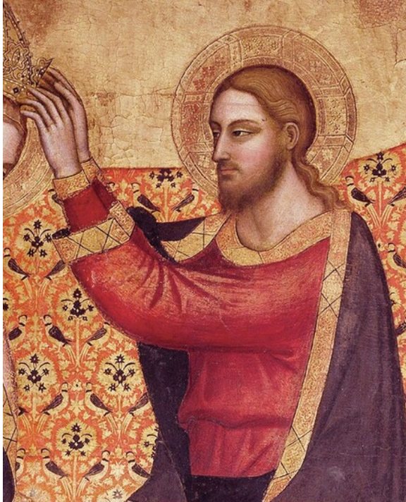
fig. 5 Detail of Jesus, Jacopo di Cione, Coronation of the Virgin (Pala della Zecca) , 1373, tempera on panel, Galleria dell'Accademia, Florence.