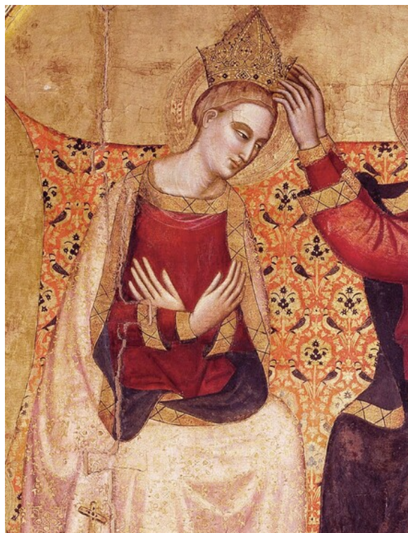
fig. 1 Detail of Mary, Jacopo di Cione, Coronation of the Virgin (Pala della Zecca) , 1373, tempera on panel, Galleria dell'Accademia, Florence.