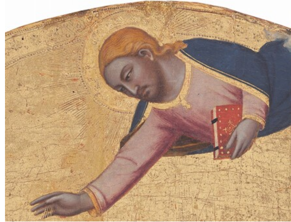
fig. 4 Detail of God the Father, Jacopo di Cione, Madonna and Child with God the Father Blessing and Angels , c. 1370/1375, tempera on panel, National Gallery of Art, Washington, Samuel H. Kress Collection