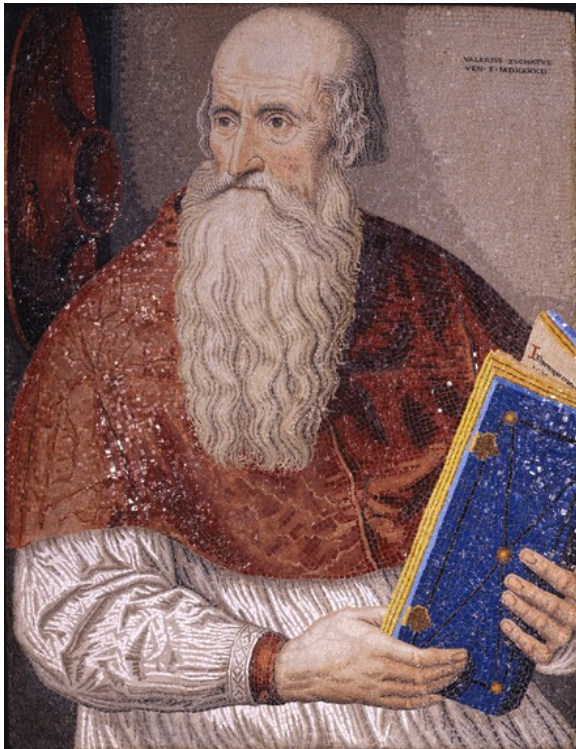
fig. 5 Valerio Zuccato, Portrait of Pietro Bembo , 1542, mosaic, Museo Nazionale del Bargello, Florence