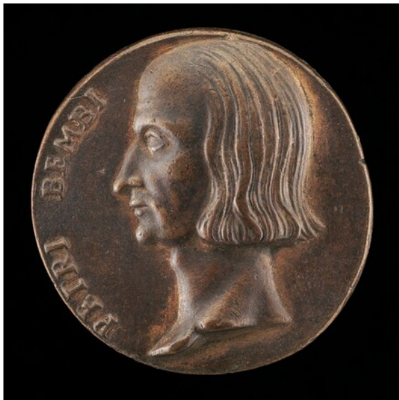
fig. 1 Valerio Belli, Pietro Bembo, 1470–1547, Cardinal 1538 [obverse], probably 1532, bronze, National Gallery of Art, Washington, Samuel H. Kress Collection