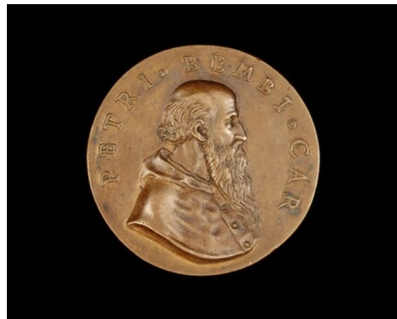
fig. 2 Italian 16th Century (Attributed to Benvenuto Cellini), Pietro Bembo, 1470–1547, Cardinal 1538, Venetian Philologist, Poet and Belletrist [obverse], 1537/1547, bronze, National Gallery of Art, Washington, Samuel H. Kress Collection