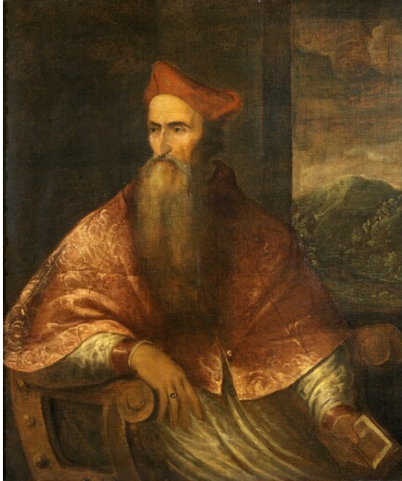
fig. 3 Titian, Portrait of Cardinal Pietro Bembo (1470–1547) , 1545, oil on canvas, Museo Nazionale di Capodimonte, Naples.