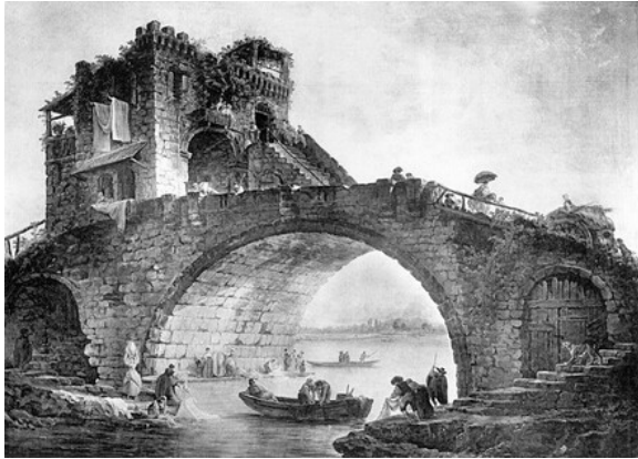
fig. 3 Hubert Robert, The Ponte Salario , 1783, oil on canvas, private collection. The Wildenstein Institute