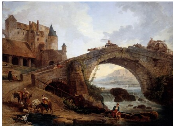
fig. 2 Hubert Robert, The Bridge , 1776, oil on canvas, Musée Fabre.