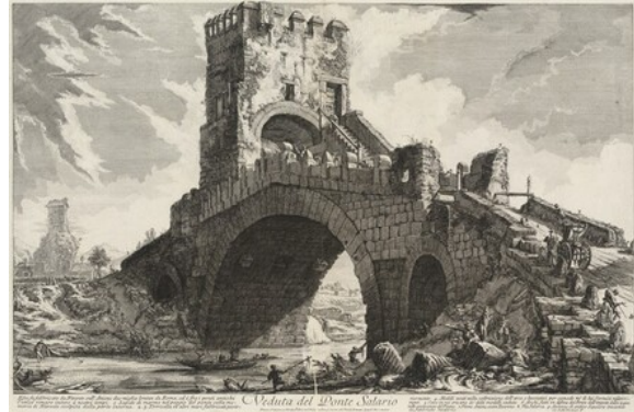
fig. 4 Giovanni Battista Piranesi, Veduta del Ponte Salario , 1756/1757, etching, National Gallery of Art, Washington, Gift of David Keppel