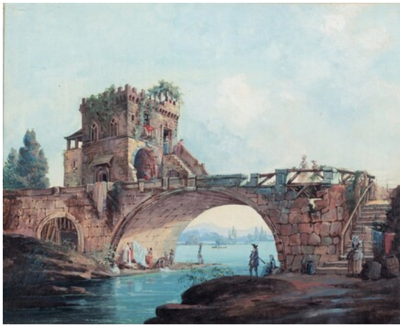
fig. 5 After Hubert Robert, The Ponte Salario , possibly late eighteenth century, watercolor and gouache on paper, private collection.