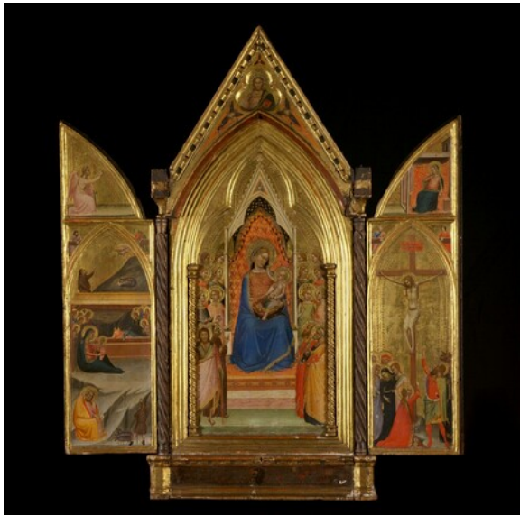
fig. 1 Bernardo Daddi, Virgin and Child Enthroned with Saints, and God in an Attitude of Benediction , 1338, tempera and gold leaf on panel, Courtauld Institute of Art, The Courtauld Gallery, London.