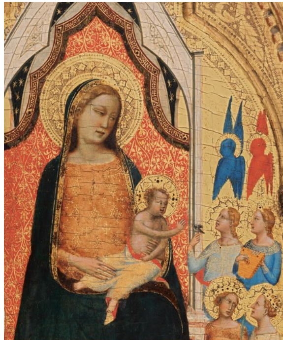
fig. 2 Detail, Bernardo Daddi, Madonna and Child with Saints and Angels , c. 1340, tempera on panel, National Gallery of Art, Washington, Samuel H. Kress Collection