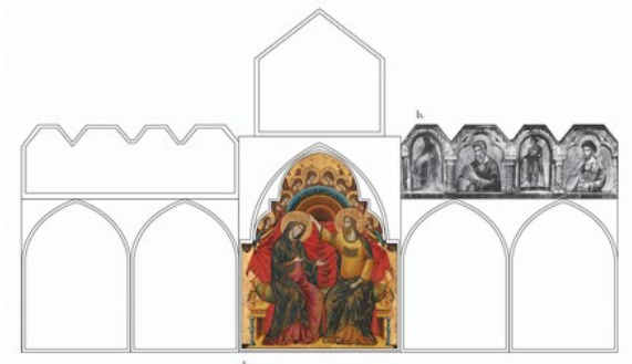
fig. 1 Reconstruction of a dispersed polyptych by the Master of the Washington Coronation: a. The Coronation of the Virgin ; b. Two Apostles and the Prophets Jeremiah and Ezekiel (?) (fig. 2)