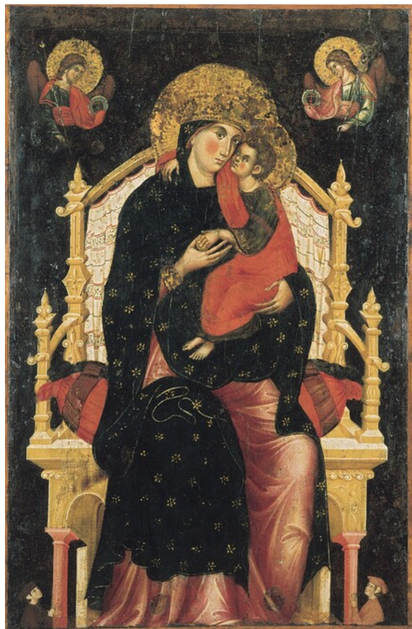
fig. 3 Master of the Washington Coronation, Madonna and Child with Angels and Donors , early fourteenth century, tempera on panel, Pushkin Museum of Fine Arts, Moscow.