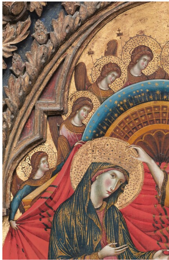
fig. 4 Detail, Master of the Washington Coronation, The Coronation of the Virgin , 1324, tempera on poplar, National Gallery of Art, Washington, Samuel H. Kress Collection