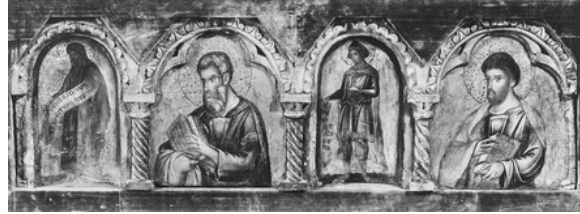
fig. 2 Master of the Washington Coronation, Two Apostles and the Prophets Jeremiah and Ezekiel (?) , 1324, tempera on panel, formerly Vittorio Cini collection, Venice