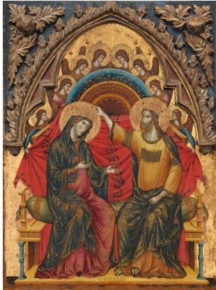
Master of the Washington Coronation Italian, active first third 14th century