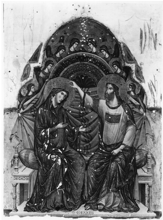
fig. 2 Archival photograph, pre-1953, Master of the Washington Coronation, The Coronation of the Virgin , 1324, tempera on poplar, National Gallery of Art, Washington, Samuel H. Kress Collection