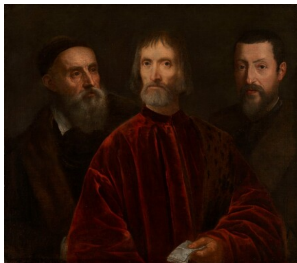
fig. 2 After Titian, Titian and His Friends, c. 1550/1560, oil on canvas