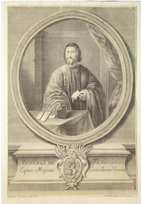
fig. 3 Crescenzo Ricci, after Titian, Portrait of Andrea de' Franceschi , 18th century, engraving, Museo Correr.