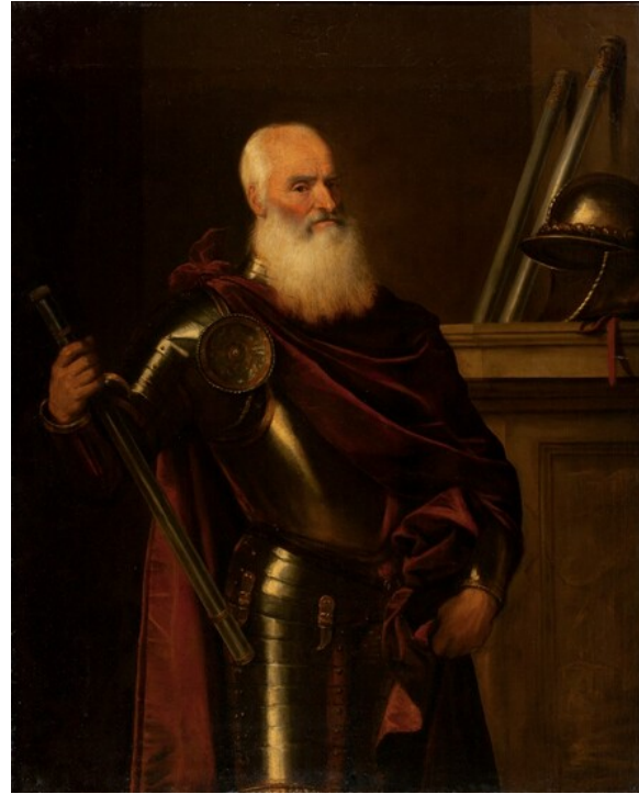
fig. 2 Here attributed to Workshop of Titian, Portrait of Admiral Vincenzo Cappello , c. 1560/1570, oil on canvas, The State Hermitage Museum, Saint Petersburg.