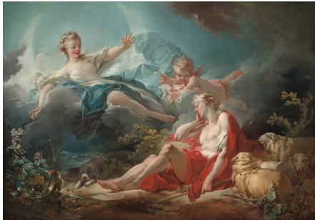
Jean Honoré Fragonard French, 1732 - 1806